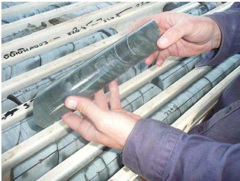
Figure 3: Photo of diamond drill core from diamond hole DD10HA003 at 221m

The recent diamond drill core and RC samples show consistent grain sizes across the deposit. The high grade magnetite core sample photographed (see Figure 3) provides visual confirmation that the magnetite has a consistent grain size coarser than 38 microns.